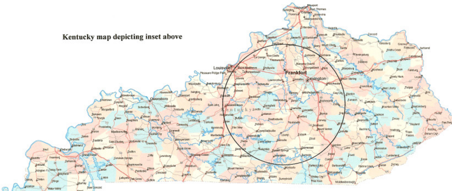
Kentucky map depicting inset above